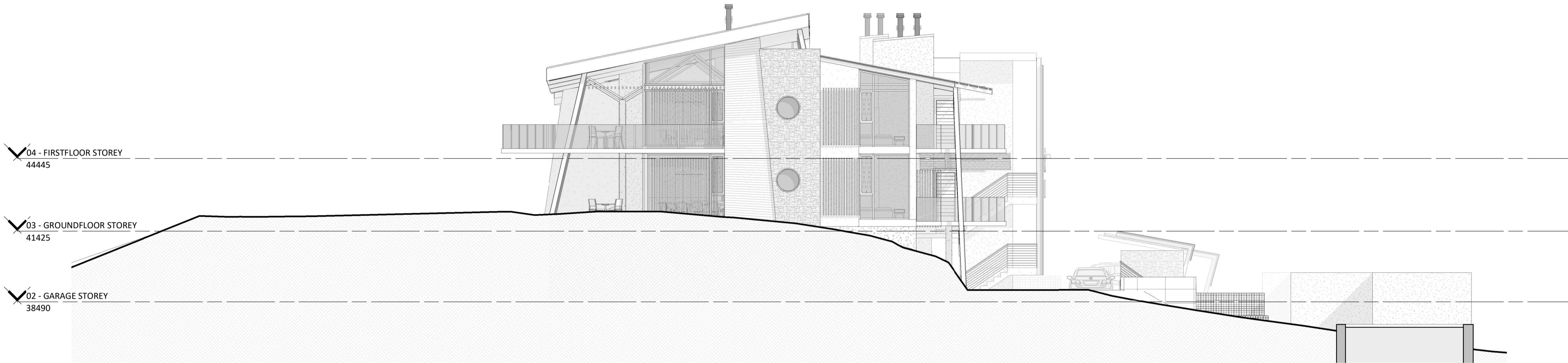
1 02 - EAST ELEVATION 1 : 100