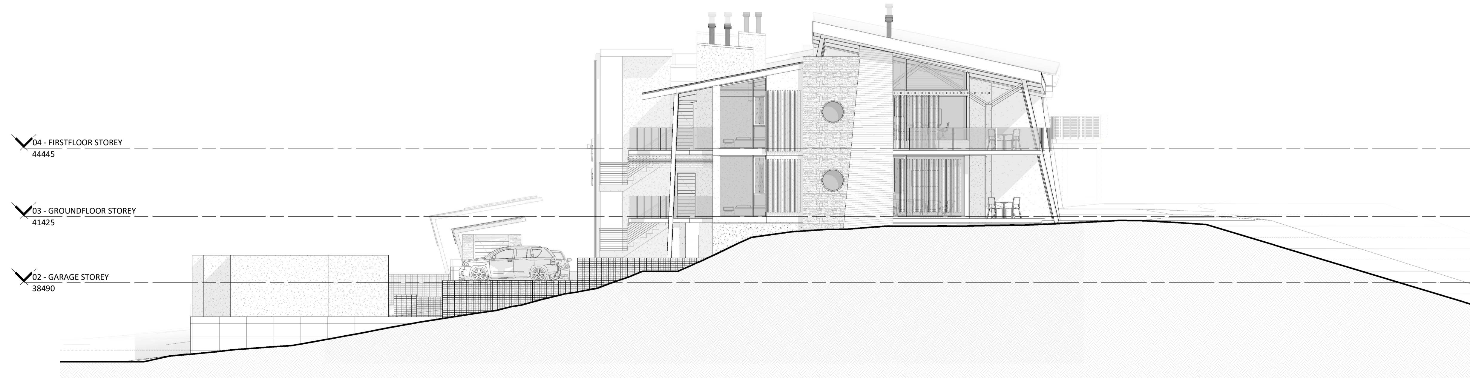
2 04 - WEST ELEVATION 1 : 100