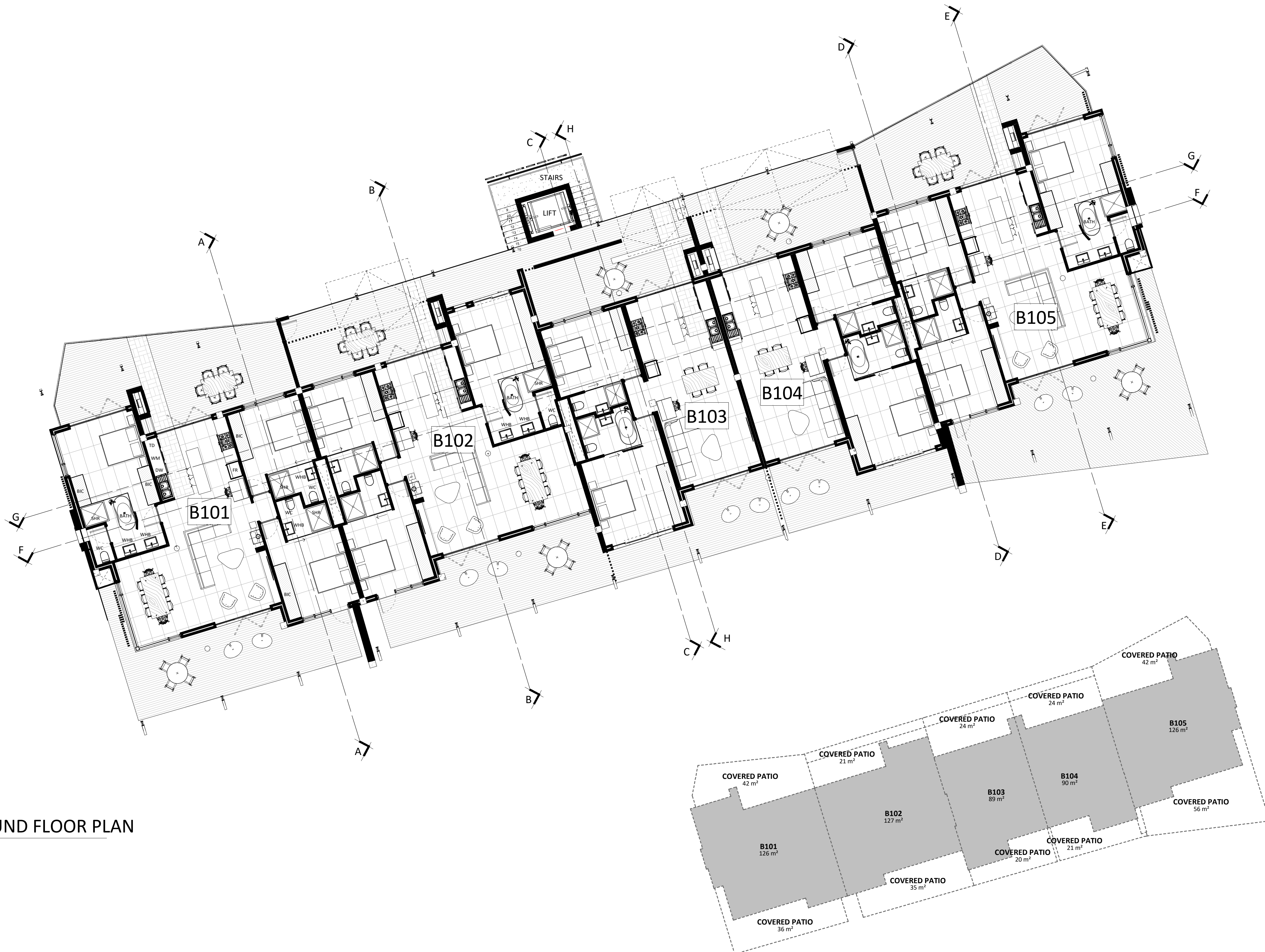
1 GROUND FLOOR PLAN 1 : 100